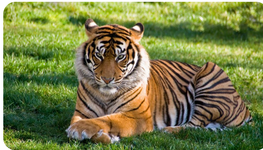
Tiger Panthera tigris