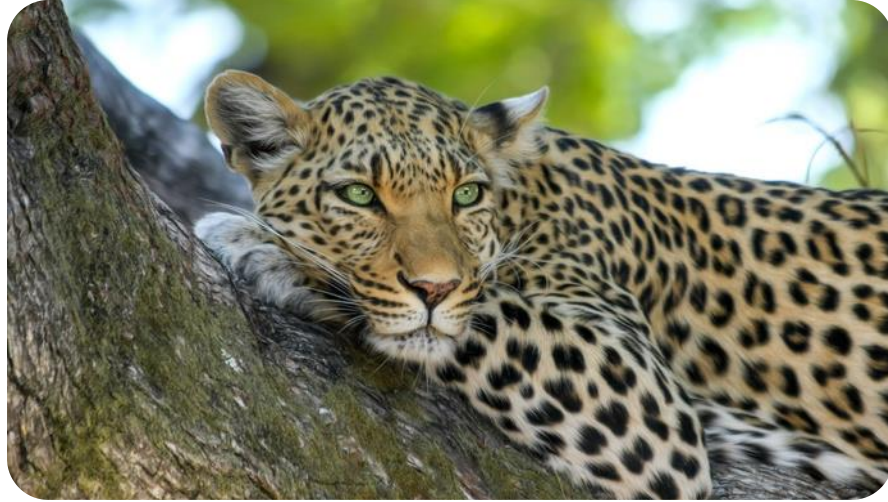
Leopard Panthera pardus