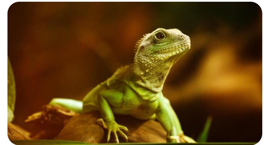
Lizard Squamate Reptiles