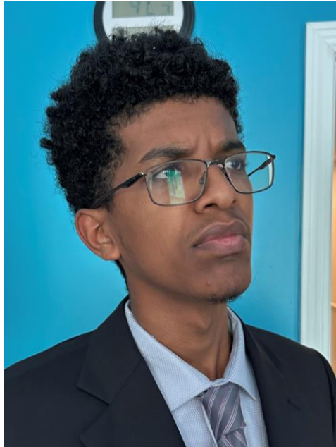
President Yusuf Abdulahi