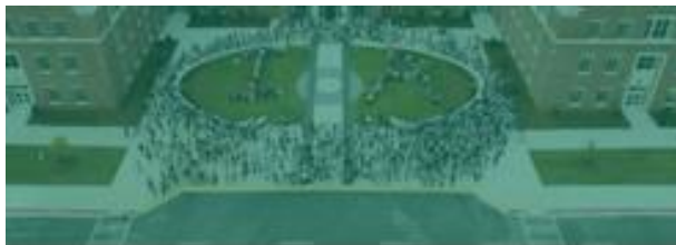
Innovation Academy Student Tem... Innovation Academy Student T...

Schedule your senior meeting with counseling team: 8/15